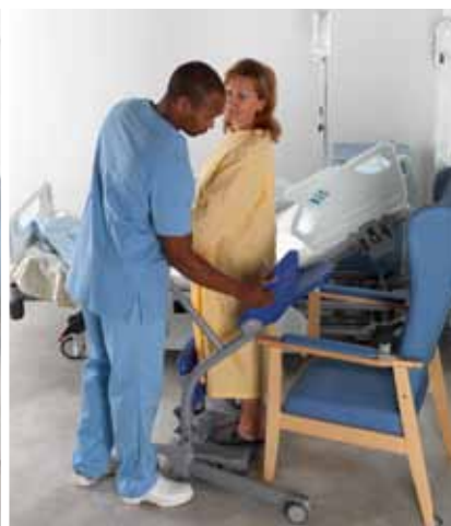
Position Sara Steady ; apply castor brakes; raise patient with the help of the integrated handlebar; swivel seat flaps into position.