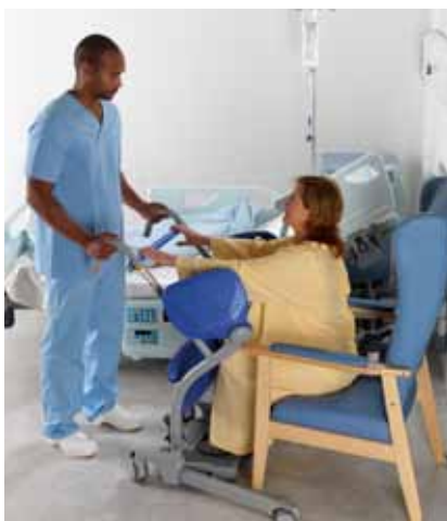
Approach patient, open seat flaps, open chassis legs and place the patient's feet on the footboard.