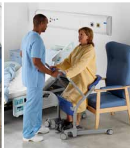
Release the brakes and proceed with the transfer.