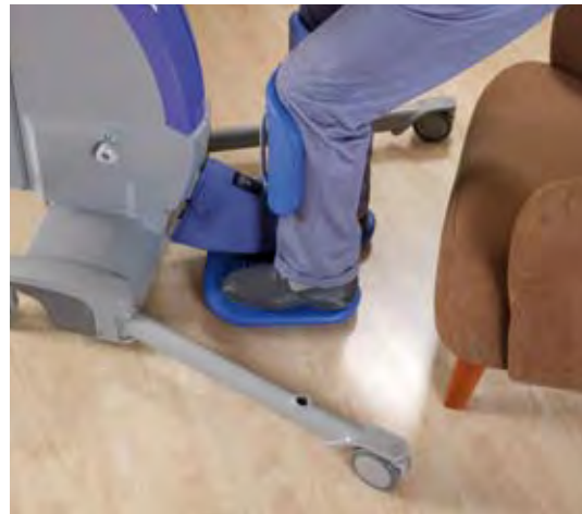
For transfers, the powered chassis can be opened for optimum access.