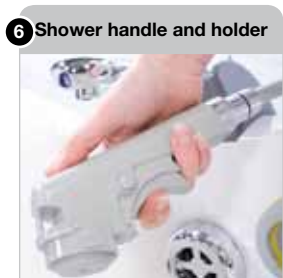
6 Shower handle and holder A new lock button feature means continuous water flow without holding in the trigger.