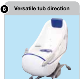
8 Versatile tub direction The standalone tub can be fitted to point in either direction, allowing flexibility for fitting pipes.