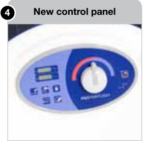
4 New control panel Digital temperature displays for monitoring tub water and shower/fill temperatures. Enhanced control of Air Spa, disinfection and Auto-fill.