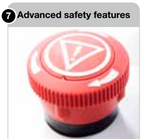
7 Advanced safety features • Emergency stop (all functions) • Scalding protection • Low-level indicator (disinfection) • Functions lock system • Battery back-up