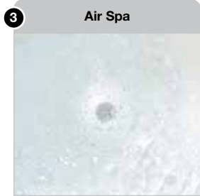
3 Air Spa The adjustable Air Spa has 2 zones, footwell or whole tub, and 2 intensity settings.