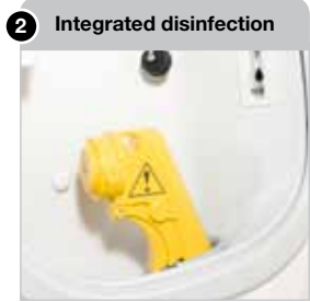
2 Integrated disinfection The built-in disinfection system ensures system hygiene for tub surfaces and Air Spa system.