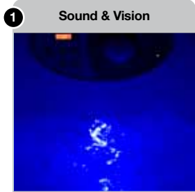
1 Sound & Vision The built-in system provides coloured underwater light and MP3 music selections.