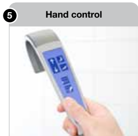
5 Hand control As well as raising, lowering and tilting the tub, the hand control can now control Air Spa settings.