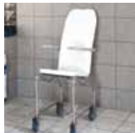
Dockable chair with wheeled chassis