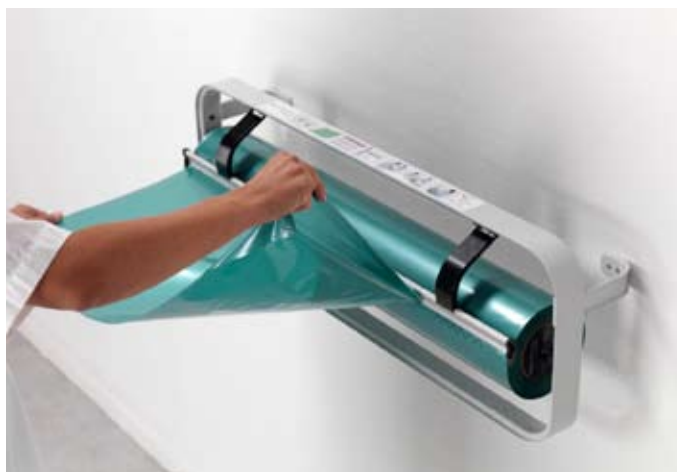
The set-up enables an efficient use of the roll since only the necessary length of material needs to be taken from the roll before each transfer.