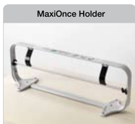
Article number: NMA2000