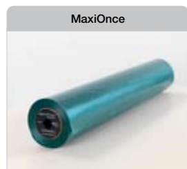
Article number: NMA1000