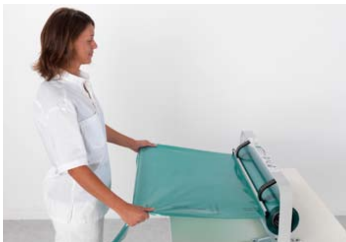
Between each ArjoHuntleigh logo, the distance is approximately 12 inches / 1 foot / 30 cm. The chart below shows the required length of MaxiOnce to be pulled from the roll.

Cost Management is high on the agenda for today's healthcare managers. MaxiOnce can help to provide safer patient transfers and reduce the risk of injuries to caregivers.