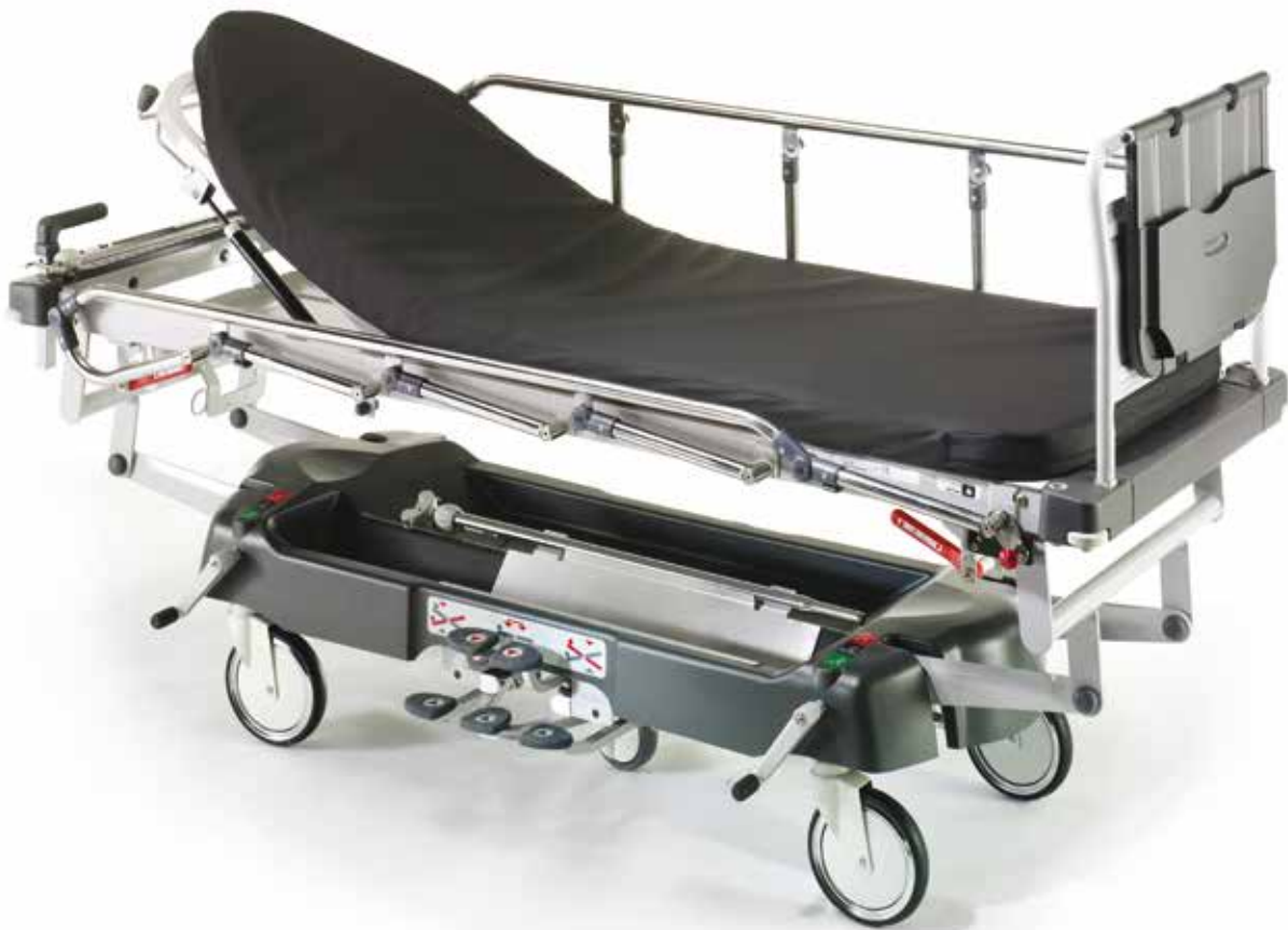
Monitor shelf / Notes holder