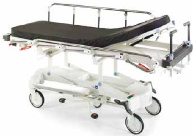
LG 20 shown in "off-white" colour

Lifeguard provides the user with a range of features to support patient management in the healthcare environment. The versatile LG 20 trolley offers a wider choice of user-defined options, and can be tailored to suit differing needs and budgets. Selectable options include an elevating X-ray cassette platform and Easitrack 5th wheel castor system.