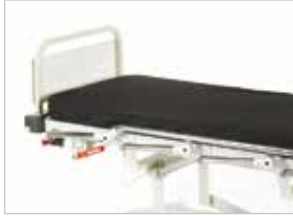
Foot end panel