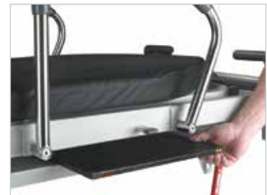
Lifeguard 50 & 20 full length elevating X-ray platform