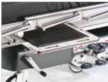
Lifeguard 55 sliding X-ray cassette holder

(Note; not suitable for use with MRI equipment)