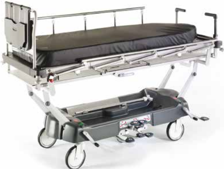
Bi-Flex mattress shown on LG 55 trolley