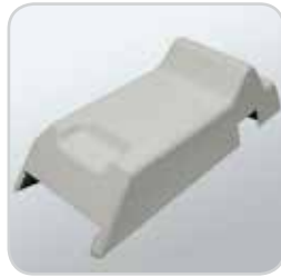
Control Box Cover