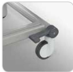
Head End Pedal