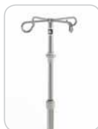
Heavy Duty IV Pole