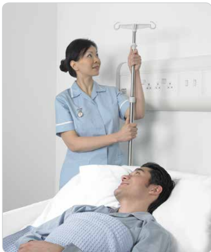
Standard IV Pole