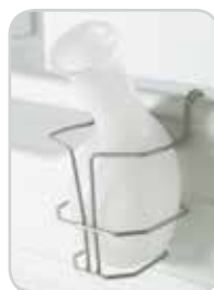
Urine Bottle Holder