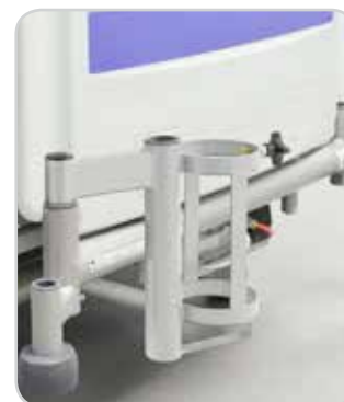
Oxygen Cylinder Holder