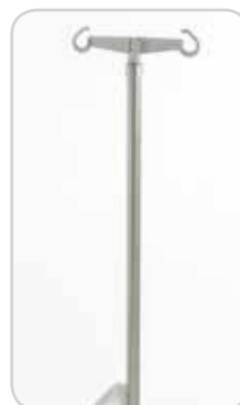
Syringe Pump Holder