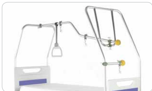
Full Frame Traction