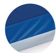
SILVER BASE MATERIAL Offering non slip properties