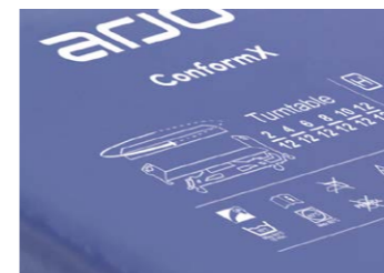
TurnTable Guide - All ConformX mattress replacement systems carry the TurnTable Guide