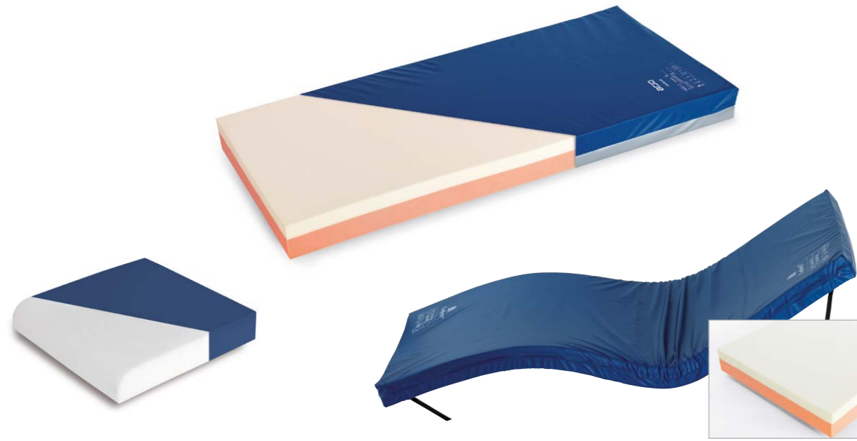
24 Hour Care Package Seat cushion available

The ConformX range has been designed to provide a 24 hour care solution. The range includes a mattress replacement, mattress overlay and seat cushion. The ConformX range is available in various sizes and is easy to maintain due to the durability of the cover and foam.