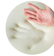
MEMORY FOAM Gently moulds to patient's body