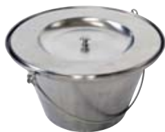
Stainless commode container with lid